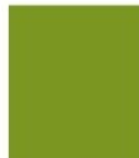
Woodland Green 9941 NCS S 3060-G40Y