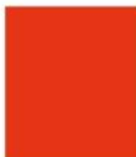
Red Beacon 9948 NCS S 1080-Y80R