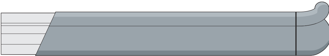
CHR110 continuous aluminium retainer with PVC-u cover