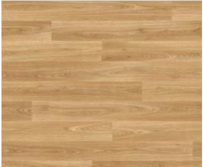
3380 American Oak Plank size: 100 x 1000mm