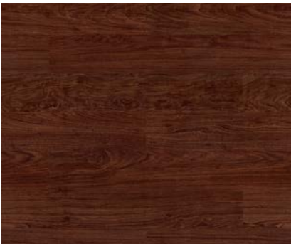
3990 Brazilian Walnut Plank size: 133 x 1000mm