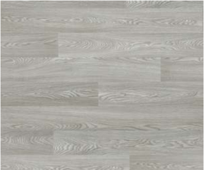
3104 Oslo Oak Plank size: 167 x 1500mm