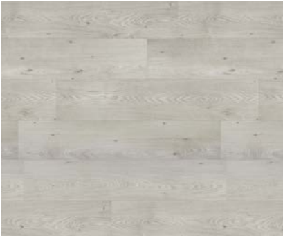
3113 Blanched Oak Plank size: 200 x 1000mm