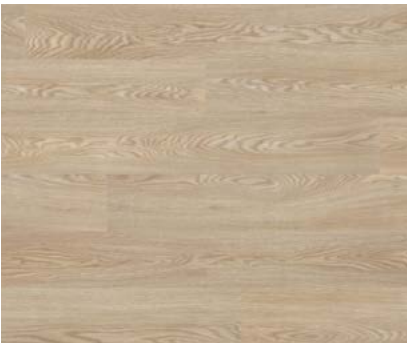
2990 Oiled Oak Plank size: 167 x 1500mm