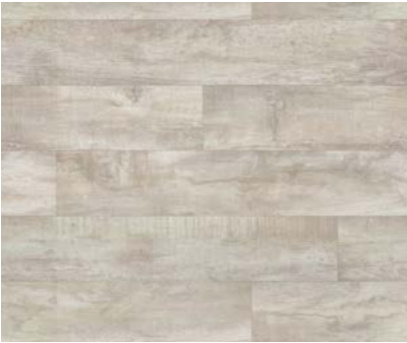
3103 Rock Salt Oak Plank size: 220 x 1500mm