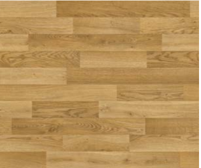
3330 Rustic Oak Plank size: 84 x 332/664mm