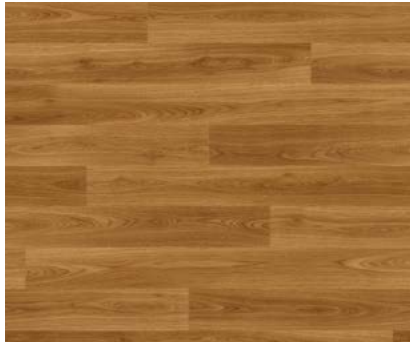
3340 European Oak Plank size: 100 x 1000mm