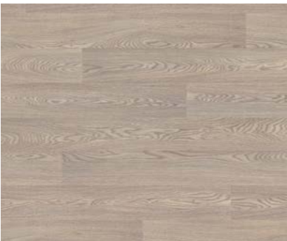
3109 Newport Oak Plank size: 167 x 1500mm