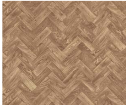
3108 Eton Oak Parquet Plank size: 76.2 x 288.6mm