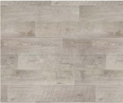
3101 Grey Sawmill Oak Plank size: 180 x 1000mm