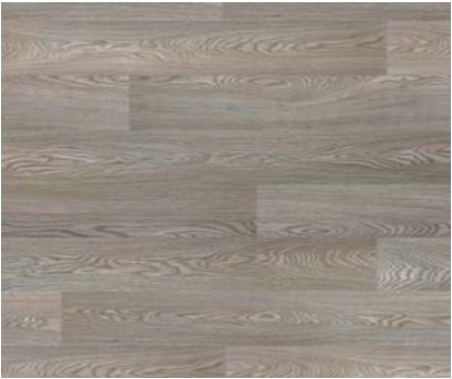
3105 Alloyed Timber Plank size: 167 x 1500mm