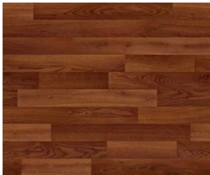
3360 Mahogany Plank size: 84 x 332/664mm