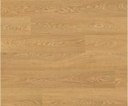
3100 Classic Oak Plank size: 167 x 1500mm