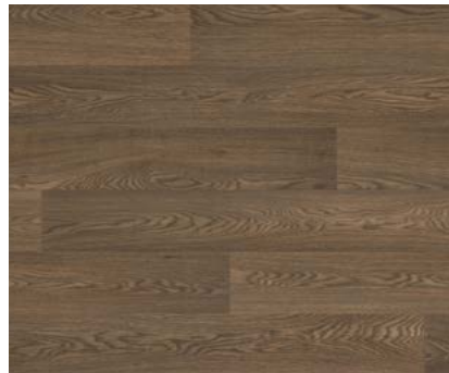
3150 Smoked Oak Plank size: 167 x 1500mm