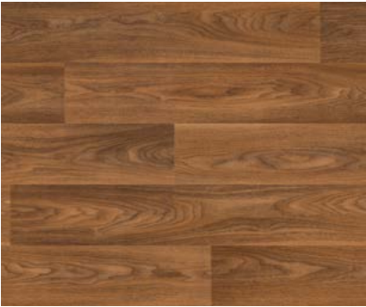
3120 French Walnut Plank size: 167 x 1000mm