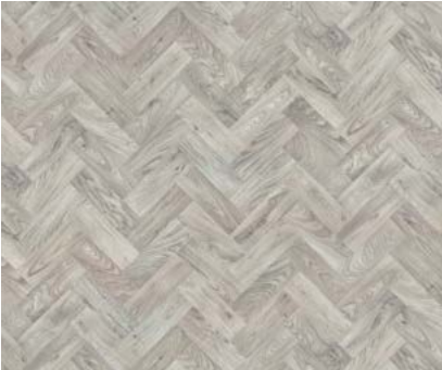
3106 Parish Oak Parquet Plank size: 76.2 x 288.6mm

Forest fx represents the natural beauty and sophistication of wood in a practical and durable vinyl sheet format. This contemporary and wide-ranging palette is further enhanced by a variety of plank sizes, each carefully designed for natural authenticity.