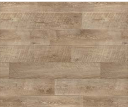
3102 Rural Deckwood Plank size: 180 x 1000mm