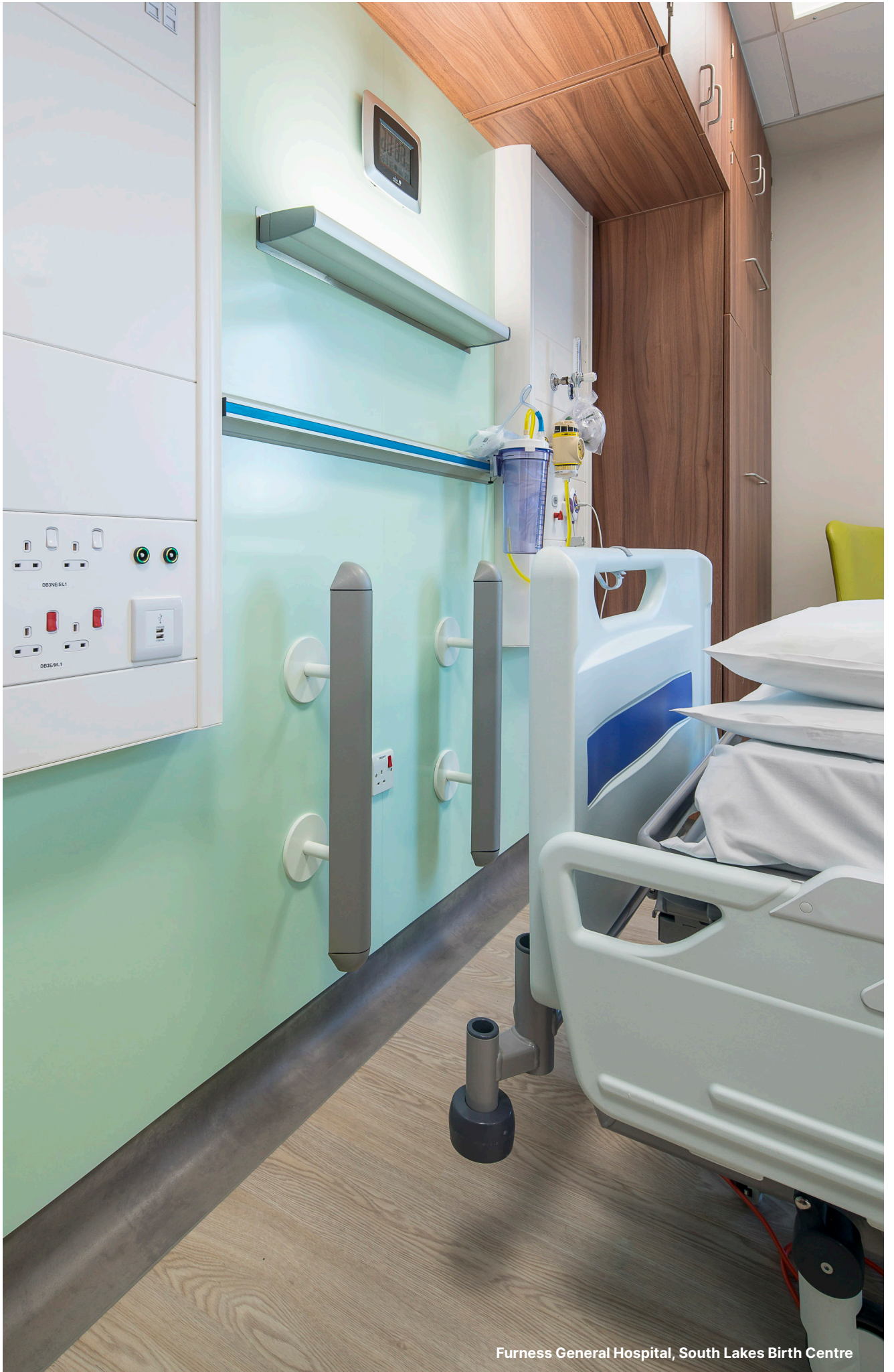
Furness General Hospital, South Lakes Birth Centre