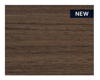
070 Walnut LRV 12.06 | NCS S 6010-Y90R