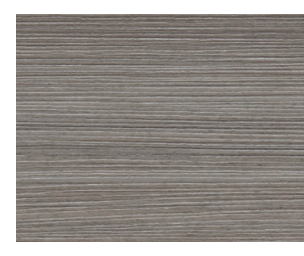
069 Brown Cedar LRV 18.4 | NCS S 6005-Y50R * Not available for handrails