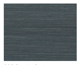
068 Smoky Cedar LRV 10.5 I NCS S 7502-B * Not available for handrails