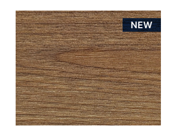
071 Cherry LRV 26.39 | NCS S 4020-Y30R