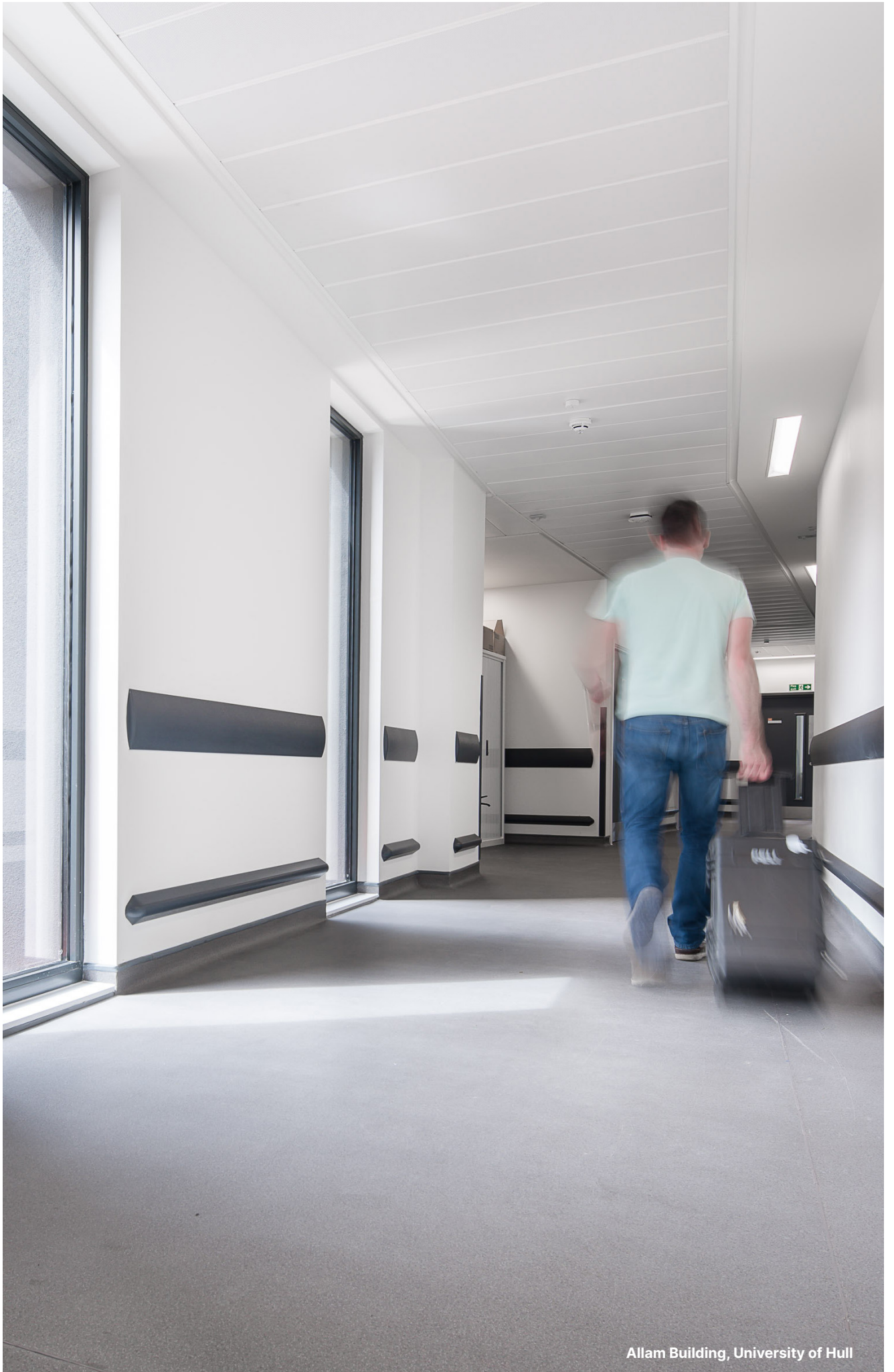
Allam Building, University of Hull