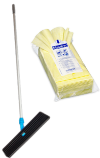
Masslinn Tool & Masslinn Cloths