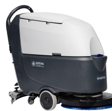
Nilfisk Automatic Scrubber-Drier