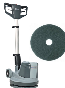
Nilfisk Low Speed Scrubber & 3M Blue Cleaner Pad