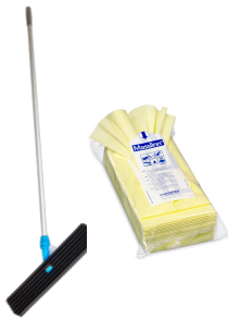
Masslinn Tool & Masslinn Cloths

*The Green Eco Brilliance Diamond Pad polishes the floor using billions of microscopic diamonds, thereby creating a sheen.