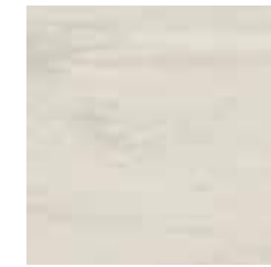
Nimbus Grey 2710 w/r 0630 NCS S 1505-Y60R LRV 70