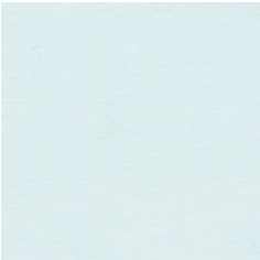
Dusted Blue 4096 w/r 4096 LRV 72