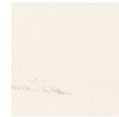
Dove White 2700 w/r 2700 NCS S 0603-Y40R LRV 72