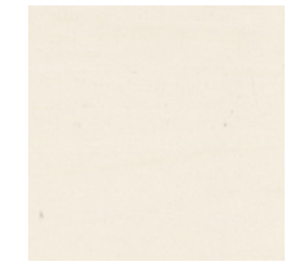
Polar Ice 2840 w/r 9520 NCS S 0603-Y40R LRV 73