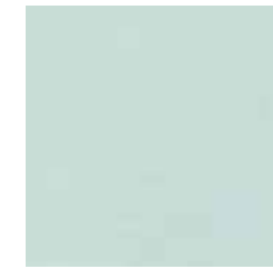
Summer Sky 2830 w/r 4430 NCS S 1510-B80G LRV 61