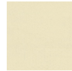
Frosted Cream 2800 w/r 3880 NCS S 0907-Y10R LRV 66